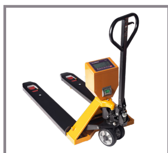
LOW PROFILE DESIGN