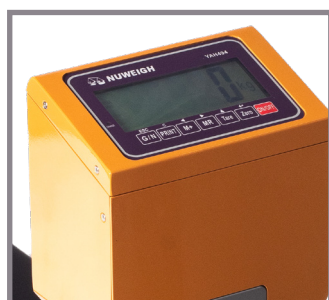
IN-BUILT THERMAL PRINTER