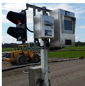
Driver Control Station Stainless Steel For Un-manned Operations