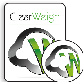
ClearWeigh Cloud Based Software Standard & Custom designed