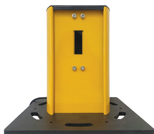
Anti-fraud Sensor Ridge Series Height 300mm