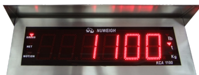
KCA1100 Remote Display Stainless Steel 120mm Digits, Wide Angle Viewing