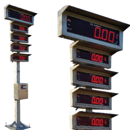
Multi Axle Display Stainless Steel Displays Each Axle Group