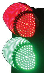
Traffic Lights Dual Aspect Red/ Green LED Lights