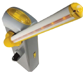
Boom Gates Versatile Speed Range From 3m - 7.6m

With over 100 years of combined experience in the Weighing Industry, NUWEIGH has developed an innovative range of Weighbridge accessories to ensure we provide the most reliable and user friendly weighing solution.