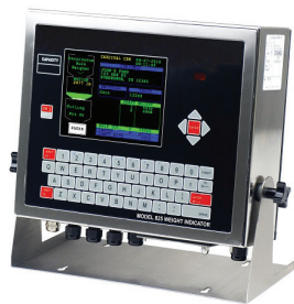
JAC825 Digital Weight Indicator Stainless Steel Touch Display