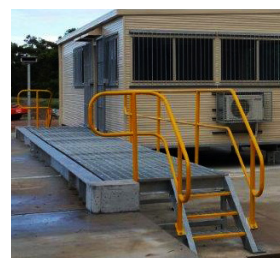
Walkway & Platform Inc. Stairs and Handrails Certified to AU Standards