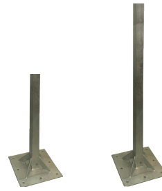
IH Poles 1.5m or 3m Hot Dip Galvanised